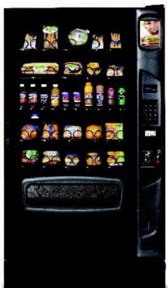
Shown in black with optional ADA door motor pairing & kick panel.