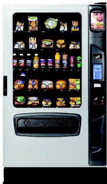
Shown in silver & black with optional ADA Door, iCart interface & kick panel.