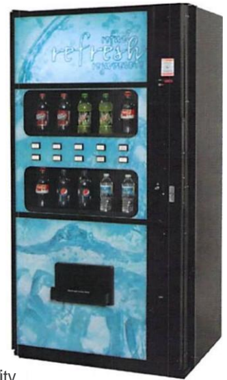
Live Display Model 650, contact factory for availability