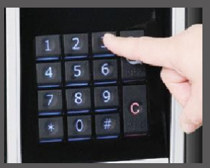
Large and easy to read selection buttons with Braille identification.