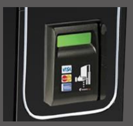
Credit/Debit card reader options.