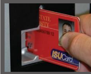
Optional Campus Card Readers