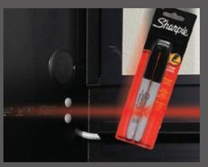
iVend® Guaranteed Delivery System

Keeps customers satisfied. Product or money back operation.