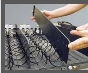
Re-configure trays to almost any package size in the field with no need for tools.

In order to bring you the best products possible, we continue to improve product design and performance and as such specifications are subject to change without notice. The manufacturer makes no warranties or representations of compliance with any local, state, national or international requirements for the operation of the equipment in any application for which it is capable of being used beyond approvals listed on the product. Any purchaser is required to make an independent analysis of the fitness and legality of the product's usage before it is deployed and must continue to monitor the potential changing nature of compliance requirements. The manufacturer expressly disclaims responsibility for compliance with any laws and affirmatively requires any buyer to make an independent analysis of the fitness and legal basis of any use or application of the subject unit.