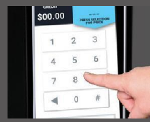
Optional touch screen interface.