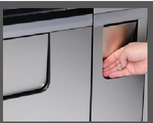
Large Friendly Product Delivery and Change Openings